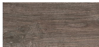
VP312_C38G / VPWP312_C38G Rio Grande