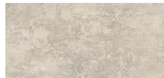
VT362_C10G / VTWP362_C10G Missouri