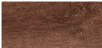
VP312_C36G / VPWP312_C36G Cimarron