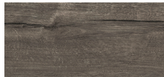
VP401_C21G / VPWP401_C21G Tennessee