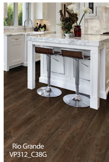
Rio Grande VP312_C38G