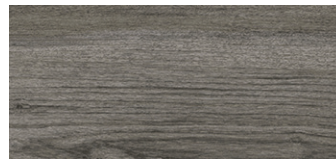
VP208_C11G / VPWP208_C11G Williamette