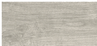
VP312_C35G / VPWP312_C35G Hudson