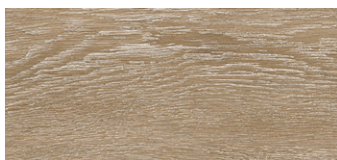
VP233_C08G / VPWP233_C08G Potomac