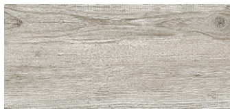
VP232_C04G / VPWP232_C04G Wabash