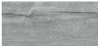
VP401_C23G / VPWP401_C23G Ottawa