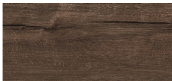
VP401_C20G / VPWP401_C20G Cumberland