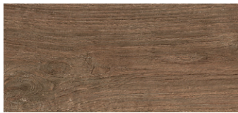
VP312_C37G / VPWP312_C37G Mississippi