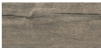
VP401_C22G / VPWP401_C22G Colorado