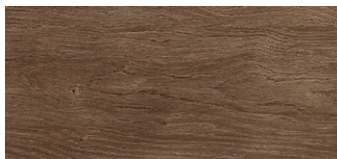
VP220_C12G / VPWP220_C12G Churchill