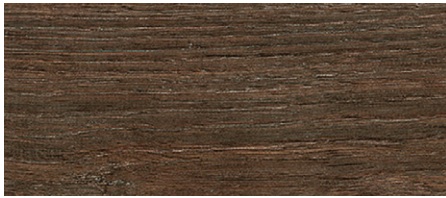
VP312_C38 Rio Grande